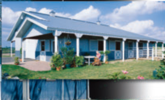
Entrance canopies are convenient, shady and aesthetically pleasing.