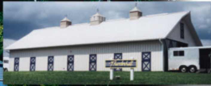
Lester designs can be adapted for a variety of commercial uses.