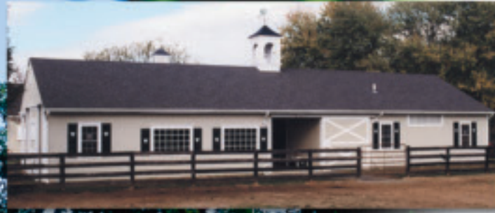
Gable styles are affordable, yet striking.

91921 36' x 196' stable with 72' x 200' arena Swope Park, Kansas City, MO