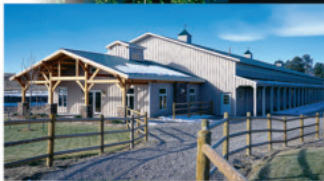
A rustic, western-style feel is easily achieved with a "timbered" stable entrance.