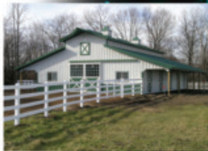
210384 40' x 60' x 10' Delano, MN