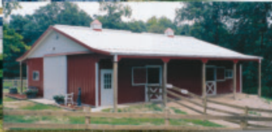
Even the simplest hobby barn can reflect your individuality – like this one with its double-porches.