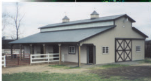
The monitor roof provides ventilation, ambient lighting or storage space over the center alley.