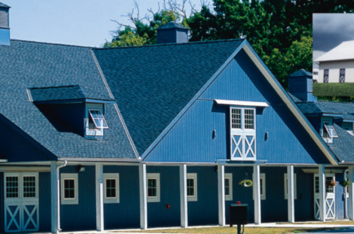
Main photo: Steeper pitches and hip-valley roof lines result in a more distinctive design.

91921 36' x 196' stable with 72' x 200' arena Swope Park, Kansas City, MO