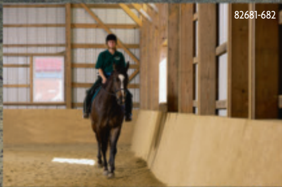
Tapered arena guards provide a safer interior perimeter for horse and rider.

Lined arenas provide comfortable riding conditions 365 days a year. The Lester system provides just the right combination of insulation and ventilation options for maximum energy savings. If you're planning to build an arena in a northern region of the country or in an area of extreme heat, a lined Lester equine arena is something you may want to consider.