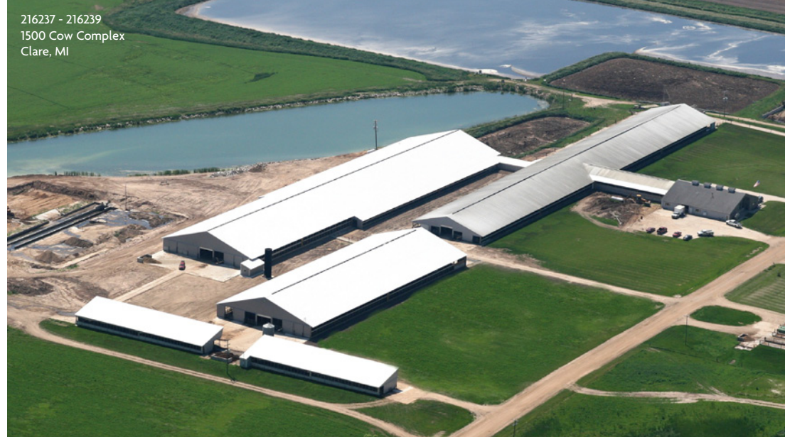
216237 - 216239 1500 Cow Complex Clare, MI