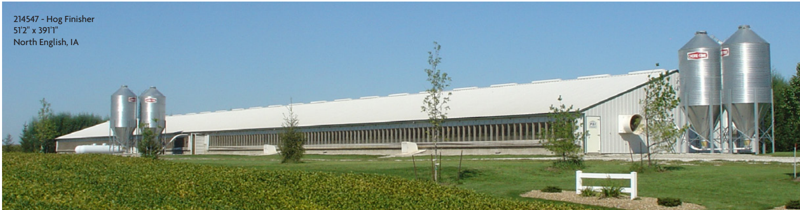
214547 - Hog Finisher 51'2" x 391'1" North English, IA