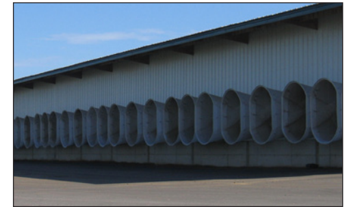
Cross Ventilating Fans