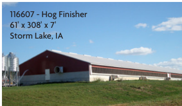
116607 - Hog Finisher 61' x 308' x 7' Storm Lake, IA

Protect your livestock and keep productivity high with Lester's popular 41', 51', 81' or 102' wide finishing buildings or a size that fits your specific needs. Only quality materials are used for key structural components.