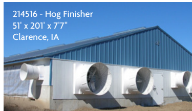
214516 - Hog Finisher 51' x 201' x 7'7" Clarence, IA