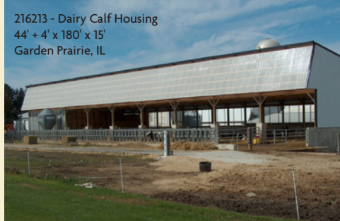
216213 - Dairy Calf Housing 44' x 4' x 180' x 15' Garden Prairie, IL