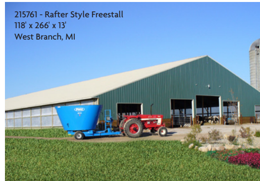
215761 - Rafter Style Freestall 118' x 266' x 13' West Branch, MI