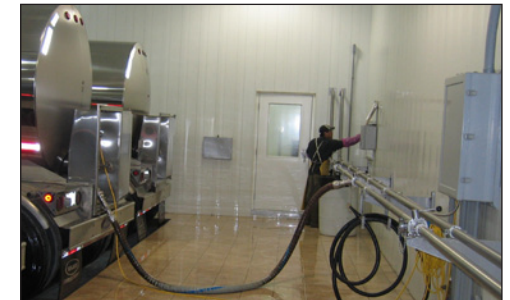
Interior Liner Panel - Nu-Plank®