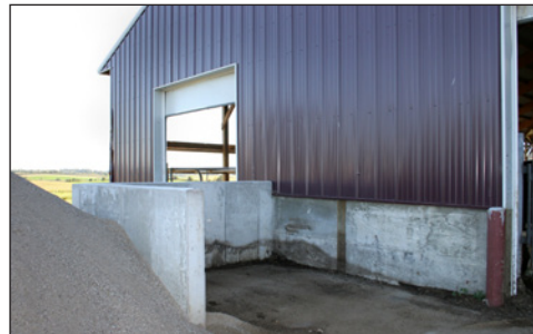
Refusel or Sand Bedding Storage