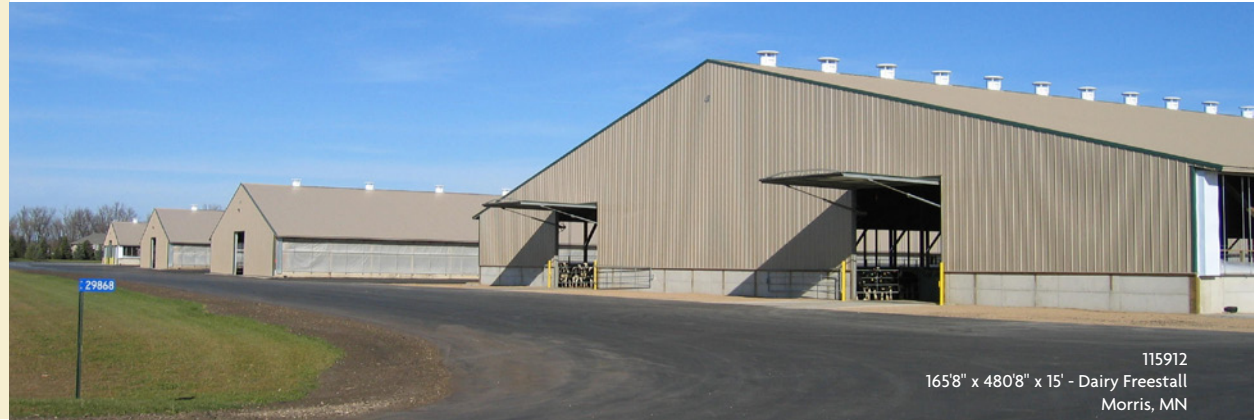
115912 165'8" x 480'8" x 15' - Dairy Freestall Morris, MN