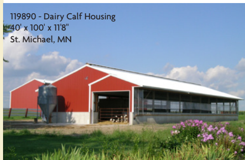
119890 - Dairy Calf Housing 40' x 100' x 11'8" St. Michael, MN