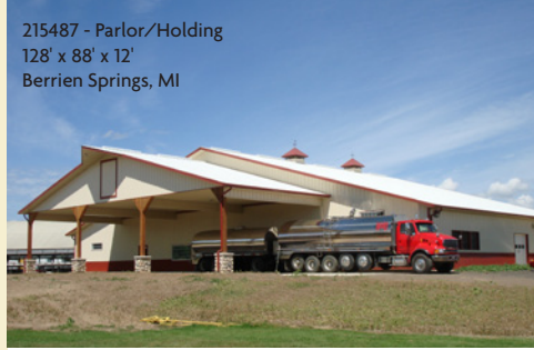
215487 - Parlor/Holding 128' x 88' x 12' Berrien Springs, MI

Count on them to assist you with a comprehensive building layout that pulls together your unique building site, building orientation, waste management system, parlor equipment and future expansion plans.