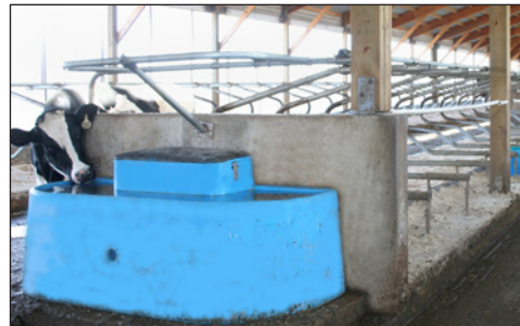
Water with Sanitary & Protection Wall