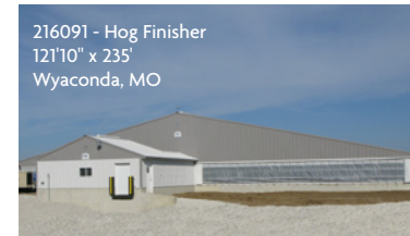
216091 - Hog Finisher 121'10" x 235' Wyaconda, MO