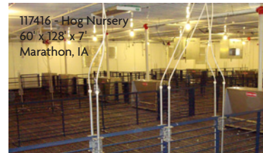
117416 - Hog Nursery 60' x 128' x 7' Marathon, IA